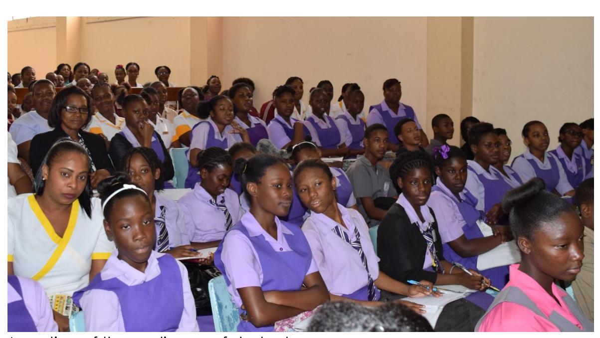
A section of the audience of students.