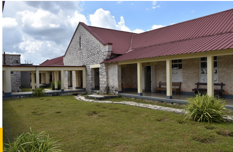
A section of the hospital depicting the cut stones structure.

The proposal was accepted and with the assistance of his sister 23 acres of land was identified and purchased. The hospital’s construction began in 1943 and lasted until 1945. The original structure of the facility is made from cut stones.