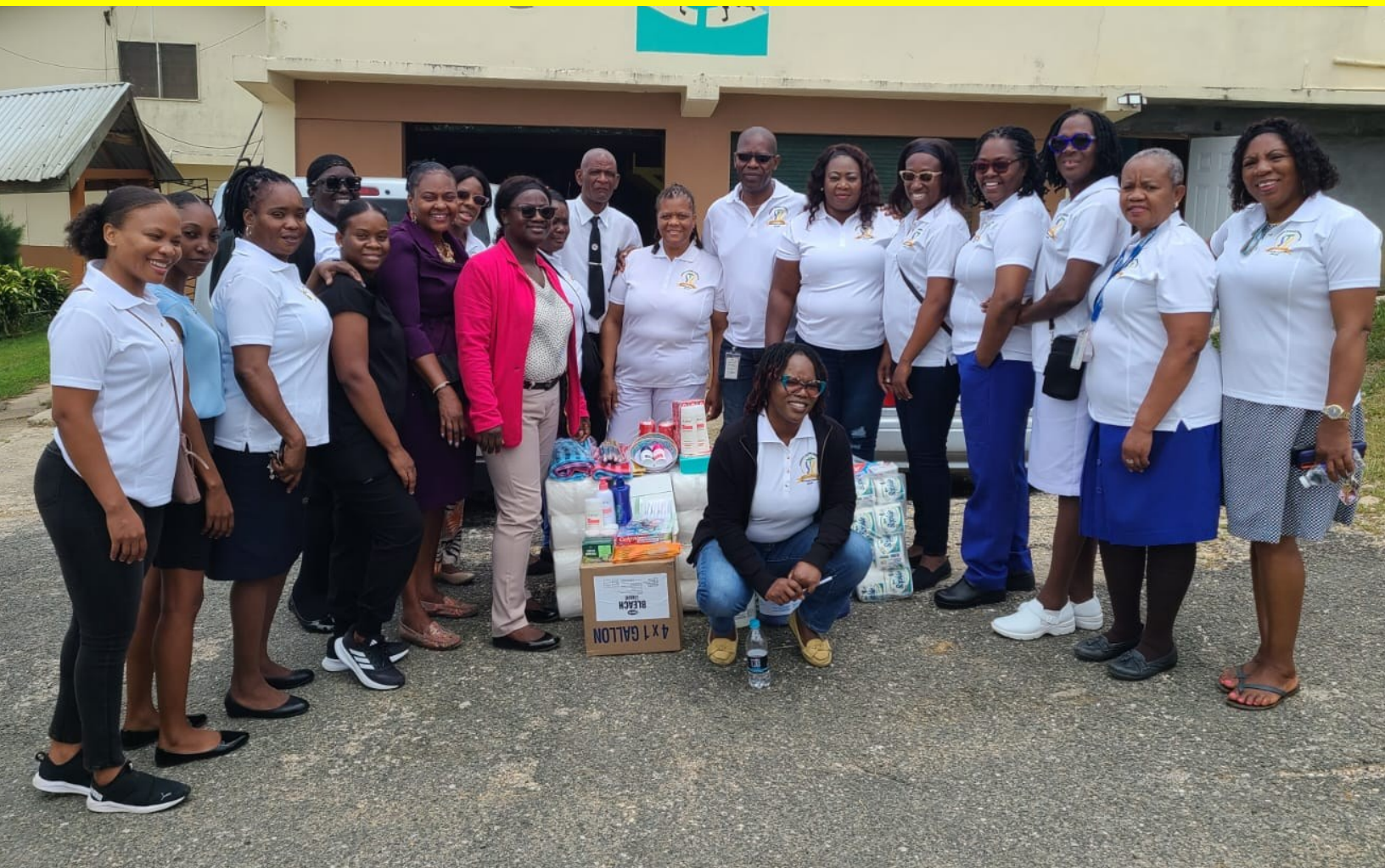
Some of the team members from the Percy Junor Hospital, following their outreach initiative at the New Vision Children's Home.