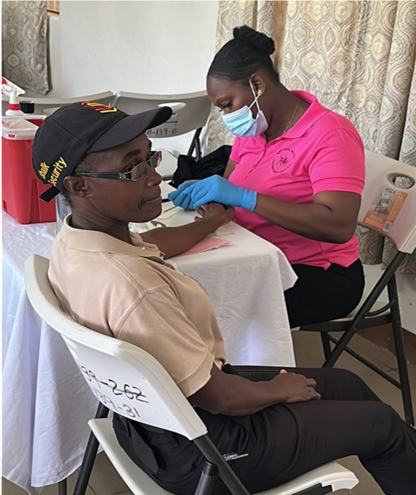
A donor giving blood at the blood drive on June 20.

The Percy Junor Hospital in Manchester is celebrating 80 years of service to its clients, in June, under the theme, “Honouring Service From the Past, Looking to the Future”.