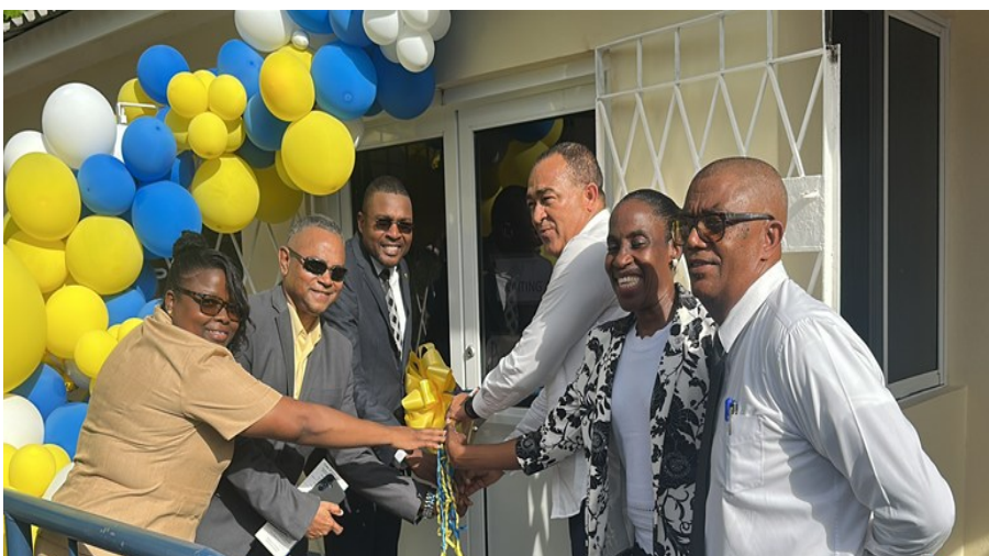
Minister of Health and Wellness, Dr. the Hon. Christopher Tufton (third right), and Member of Parliament for Clarendon North Central, Hon. Robert Morgan (third left), lead in the cutting of the ribbon for the official hand-over of the refurbished Darlow Health Centre, in Clarendon, on July 17.

Residents of Darlow and surrounding communities in Clarendon, are now accessing healthcare at the renovated Darlow Health Centre, which was completed at a cost of $5.3 million, under the Government's Operation Refresh programme.