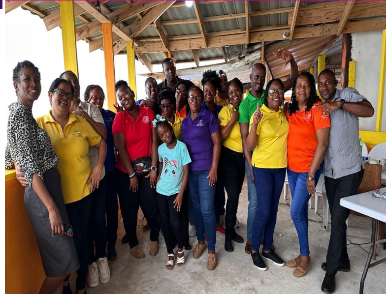
Some of the team members from the Mental Health Team