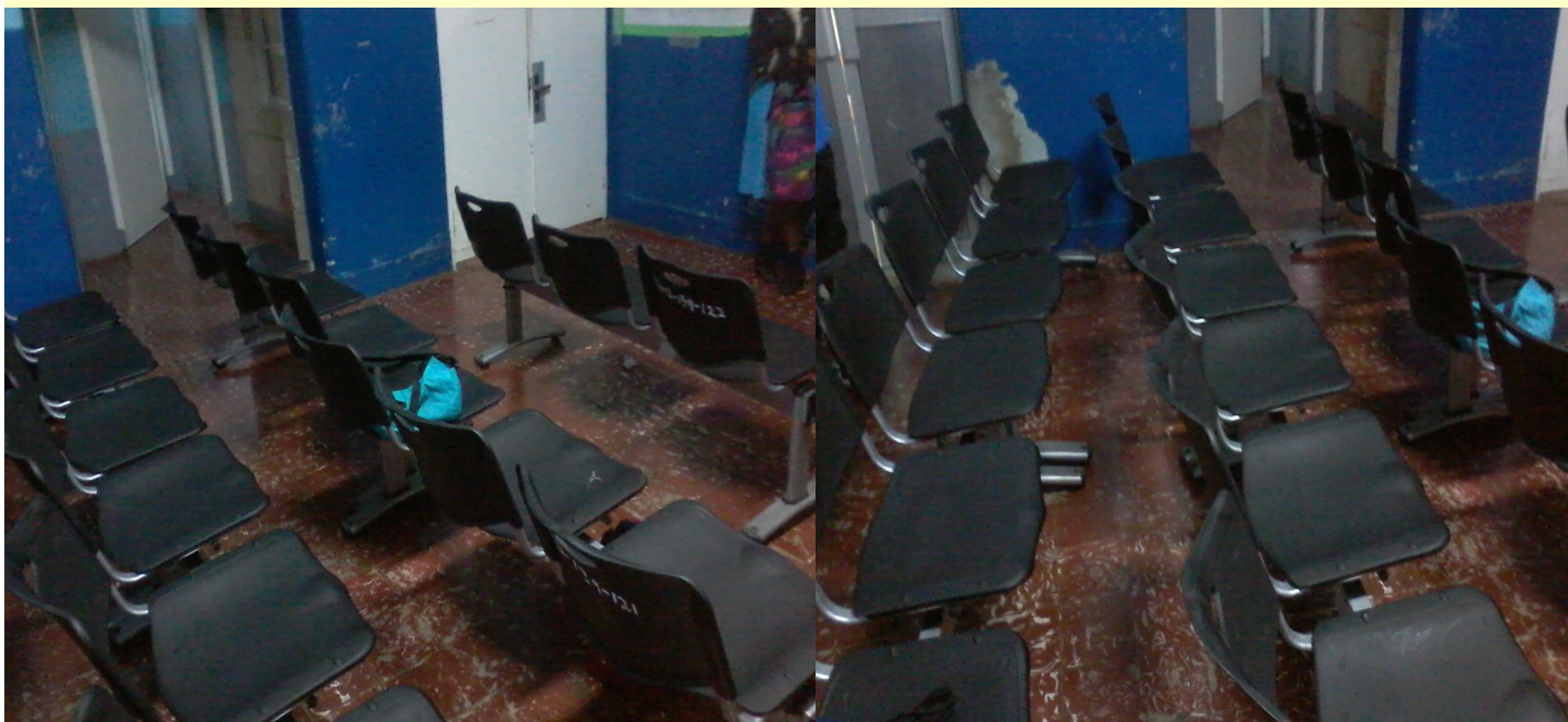
New chairs for the A&E Department.