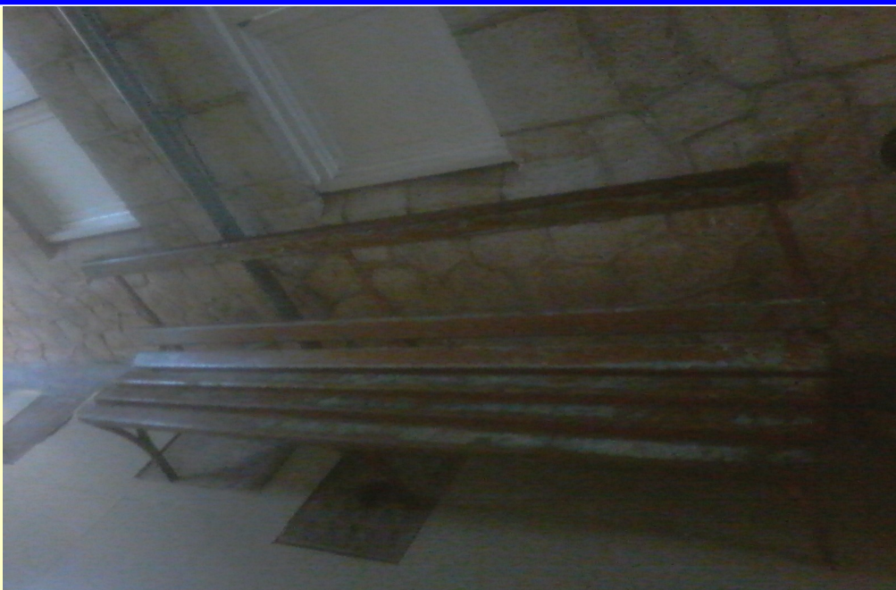
The old seating from the A&E Department.