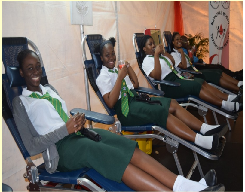
Sixth form students from the Belair High School in Manchester resting and getting refreshed after donating blood at the 'One Love, One Blood' donation drive.

Bikers from the Jamaica Motor Cyclist Association demonstrating stunt riding. They encouraged motor cyclists to wear the required protective gear.