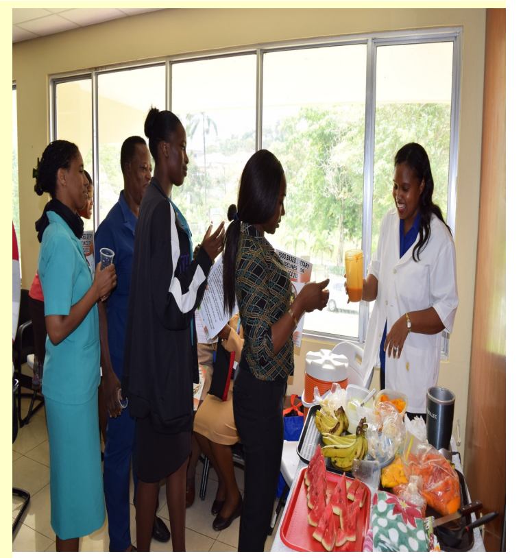
Staff in line to sample the smoothie.