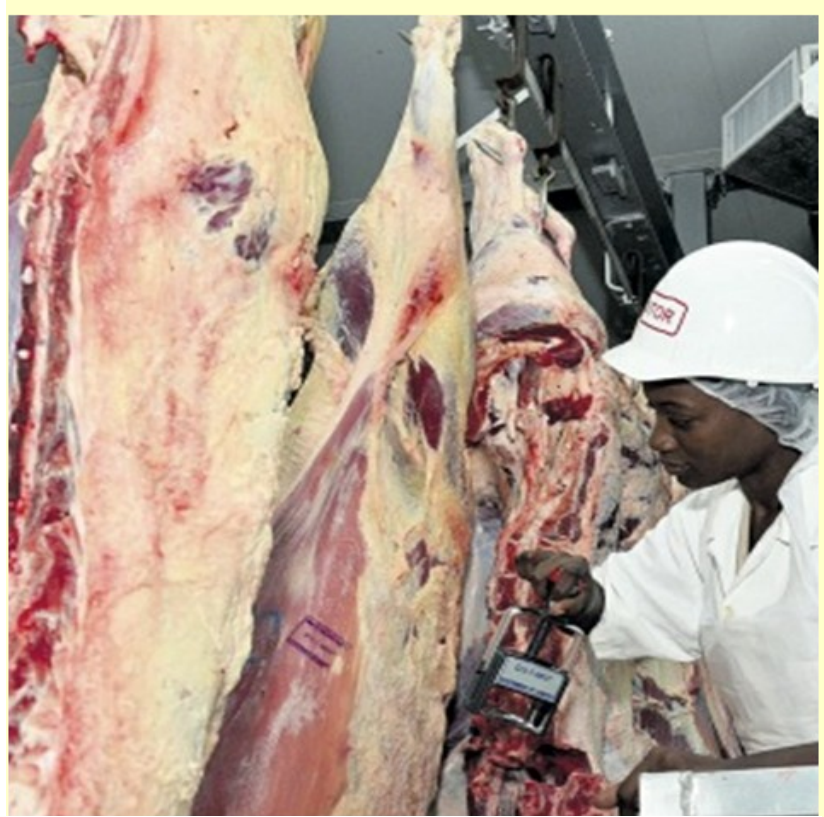
A Southern Regional Health Authority Public Health Inspector during an inspection.