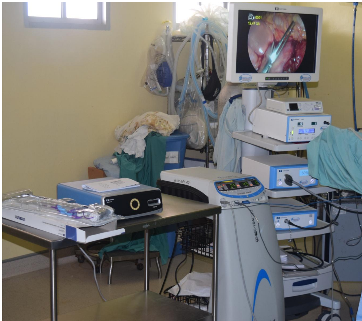
The laparoscopic tower at the Mandeville Regional Hospital.