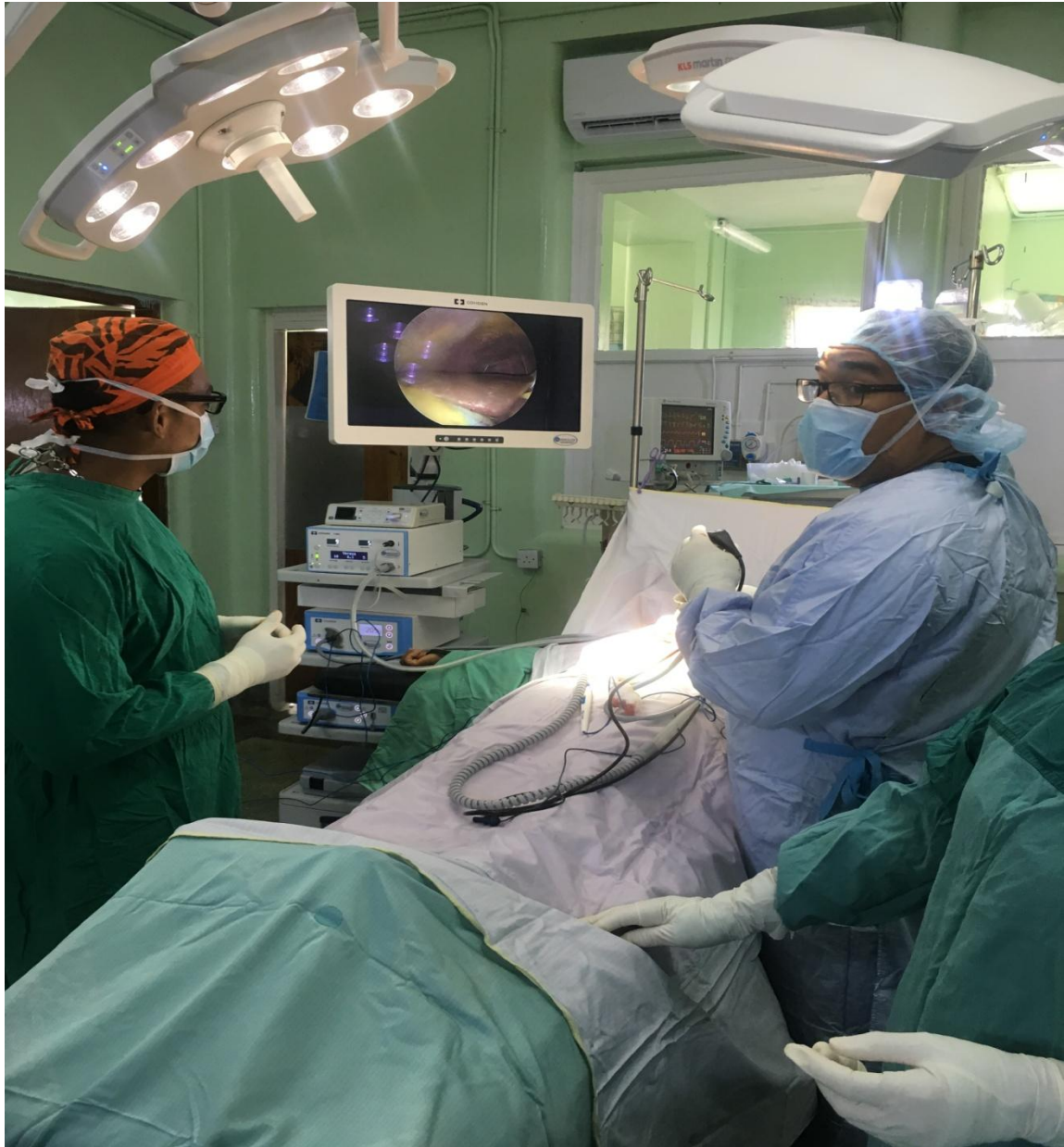
Laparoscopic surgery in progress on August 25 at the Percy Junor Hospital.